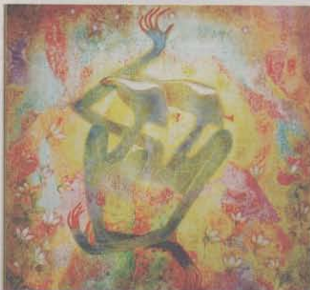
Joy of love: Lovers find bliss when they meet in this painting called The Embrace .