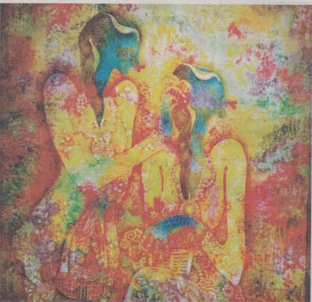
Waiting for love: The Flower Girls depicts young ladies grooming each other as they wait for the special someone.