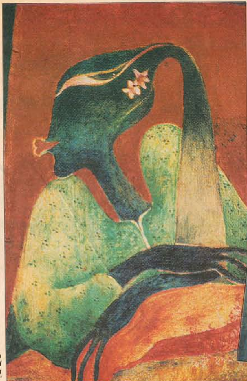
This one is titled 'Longing for love.'