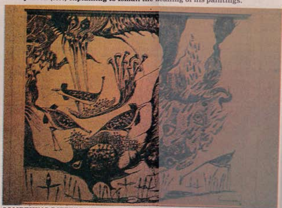
SOMETHING DIFFERENT ... one of the four drawings on show.